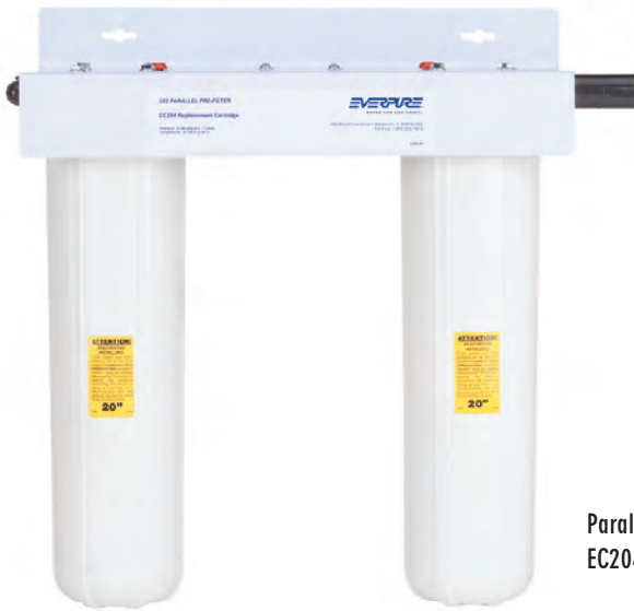
Parallel 202 Prefilter: EV9100-24 EC204 Replacement Cartridge: EV9108-40

High-volume prefilter system maximizes life of submicron filters